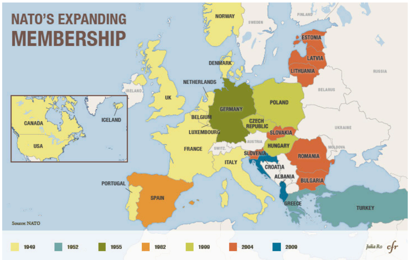
Map of NATO expansion

A renewed NATO and a much larger EU remain key players in the international system today, testifying to the enduring legacy of links and institutions created during the Cold War.