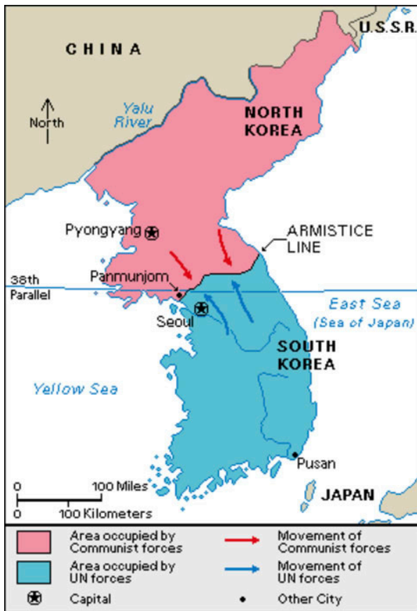
Map of divided Korea

GCSP - THE RELEVANCE OF THE COLD WAR TODAY